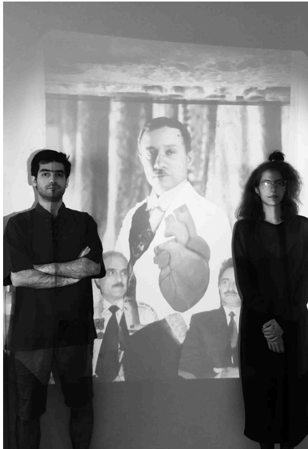
The Transparent Accent/ EKKM- Tallin

The Transparent Accent wants to emphasize that there is always a hand that intentionally builds our reality in a certain way. The question is: What is its intention?